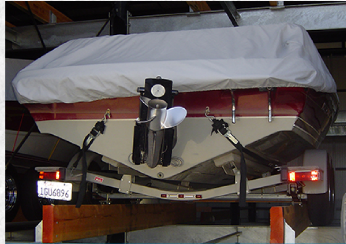
2 HIGH PORTABLE BOAT RACK FOR TRAILERED BOATS