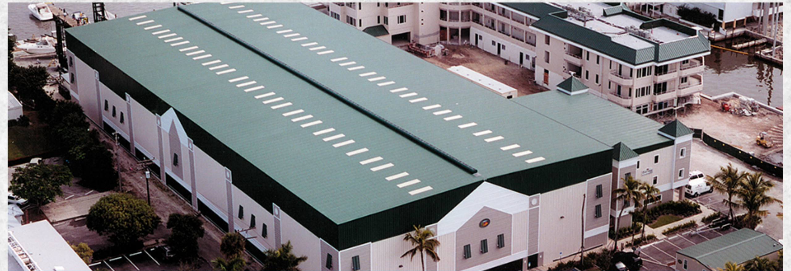
CONVENTIONAL STORAGE FACILITY NAPLES BOAT CLUB, NAPLES, FLORIDA