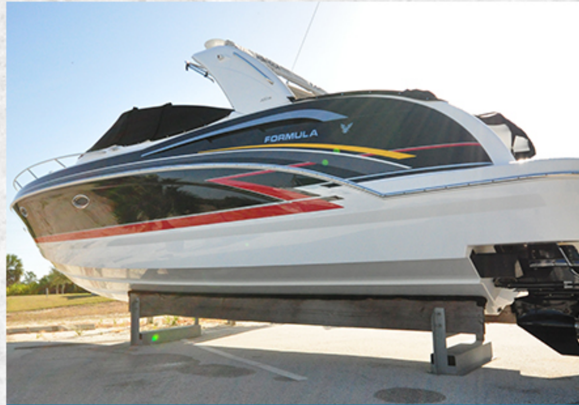
STANDARD PORTABLE YARD STAND