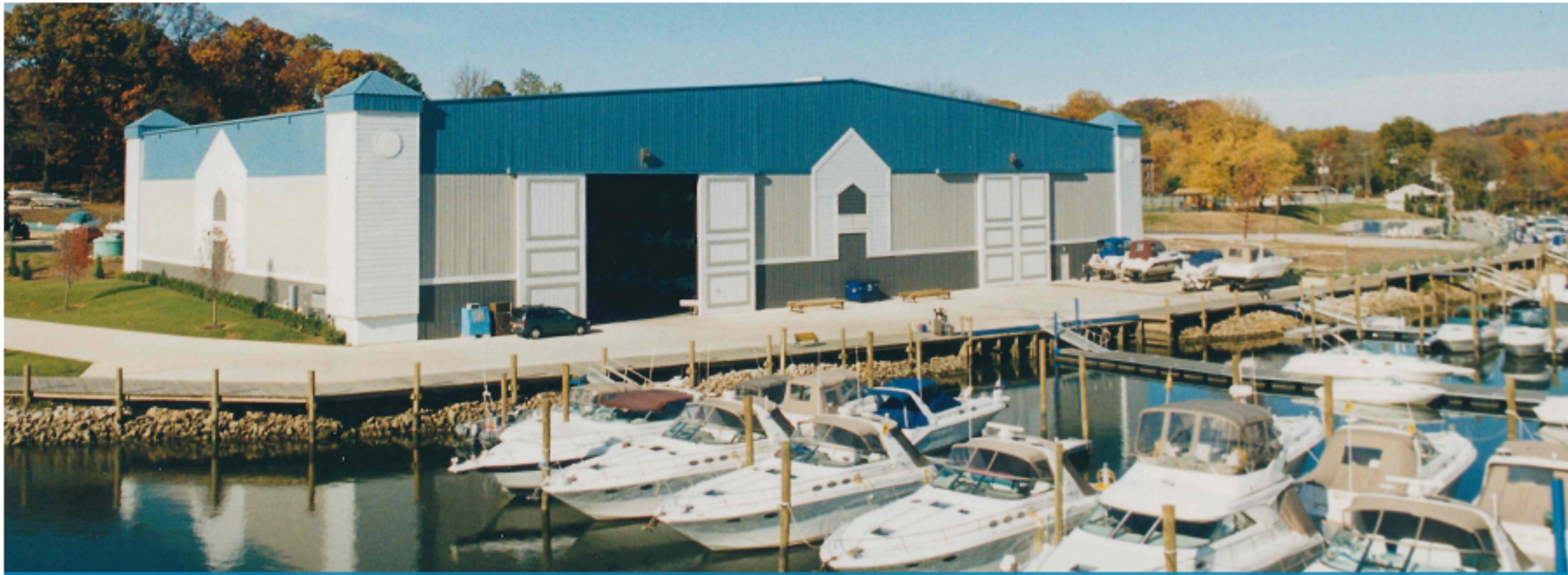
DOUBLEWIDE STORAGE FACILITY PRINCE WILLIAM MARINA, OCCOQUAN, VIRGINIA