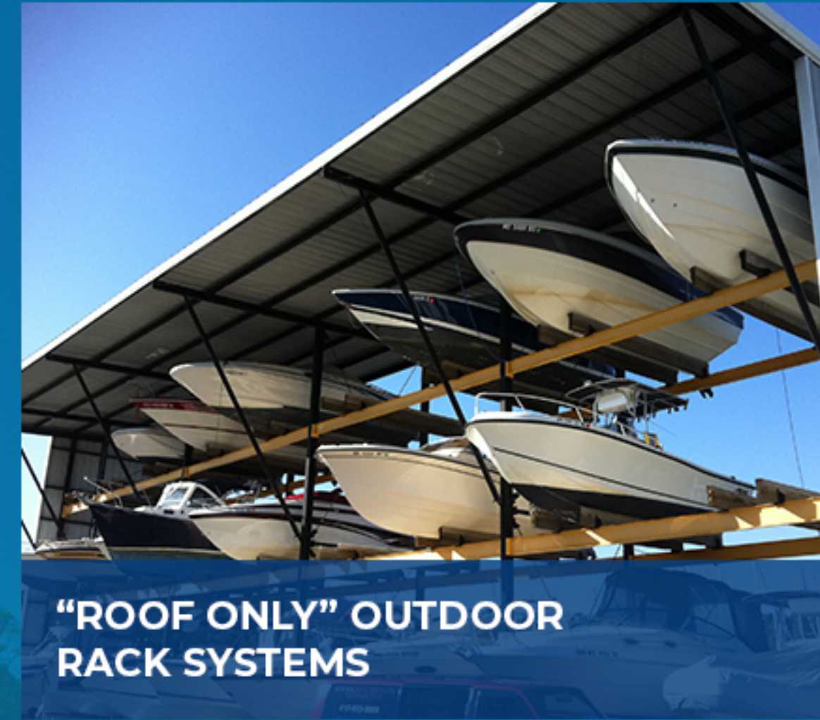
"ROOF ONLY" OUTDOOR RACK SYSTEMS

To find out more about ROOF & RACK's complete line of Dry Storage Solutions visit us online at www.roofandrack.com