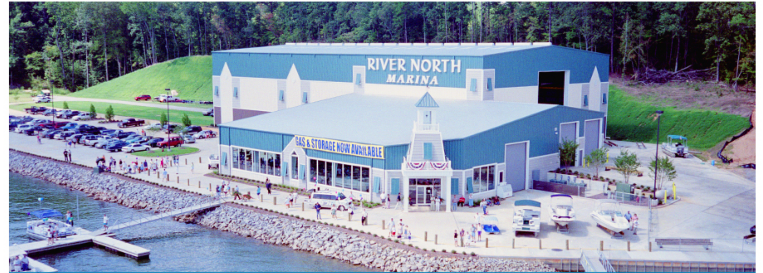
CONVENTIONAL STORAGE FACILITY RIVER NORTH MARINA, ALEXANDER CITY, ALABAMA