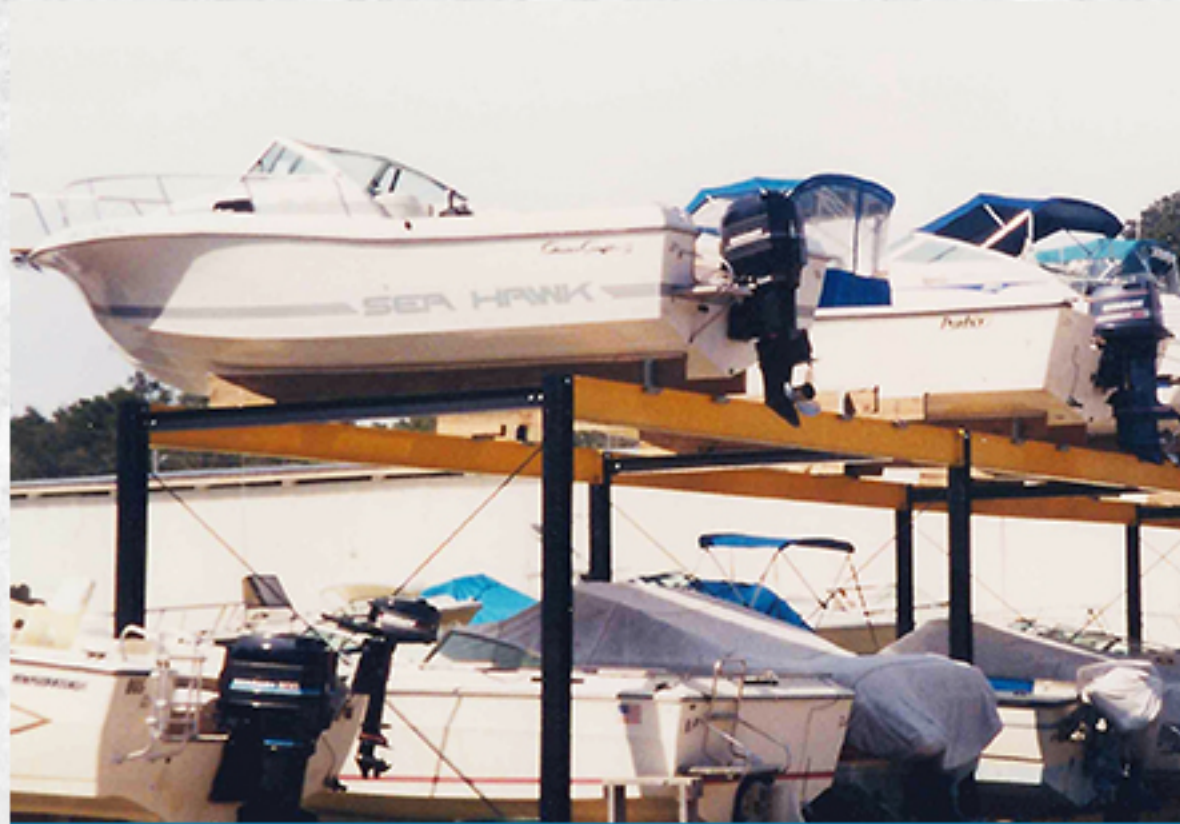
2 HIGH PORTABLE BOAT RACKS