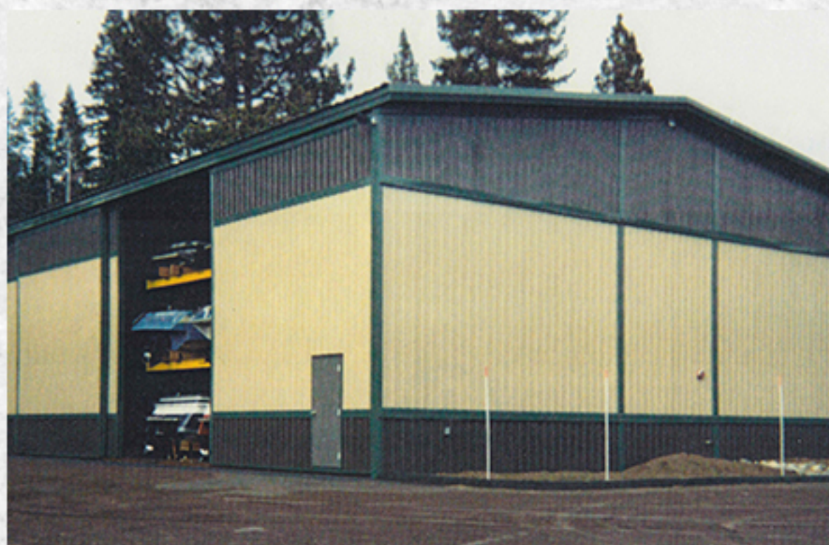
3 SIDED STORAGE FACILITY SIERRA BOAT COMPANY, LAKE TAHOE, CALIFORNIA