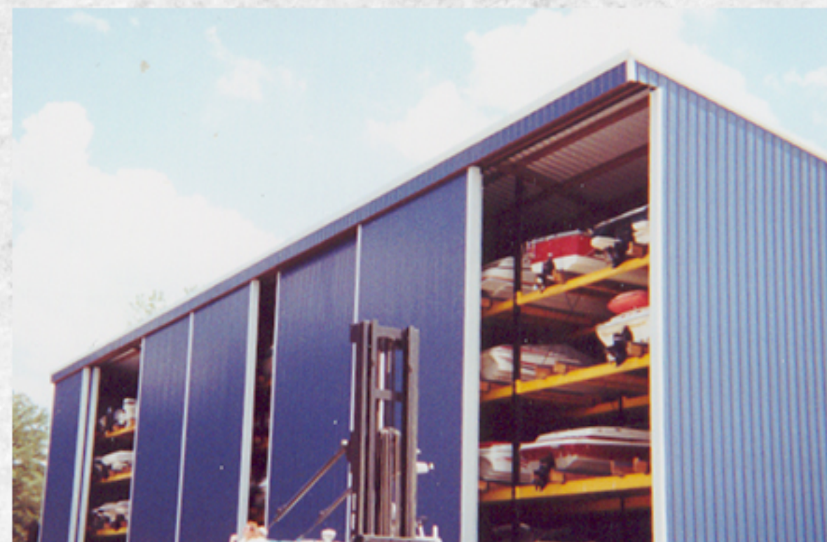
3 SIDED STORAGE FACILITY VICTORIA HARBOR MARINA, LAKE ALTOONA, GA