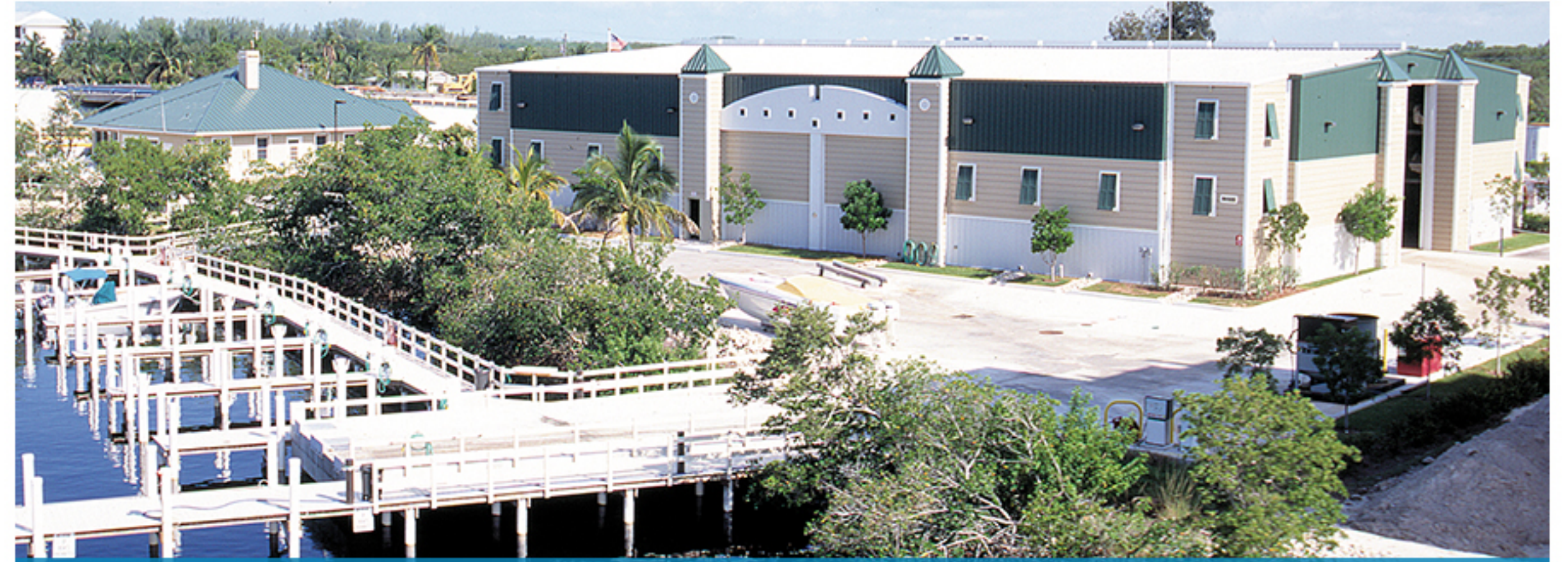
CONVENTIONAL STORAGE FACILITY BAREFOOT BOAT CLUB, BONITA SPRINGS, FLORIDA