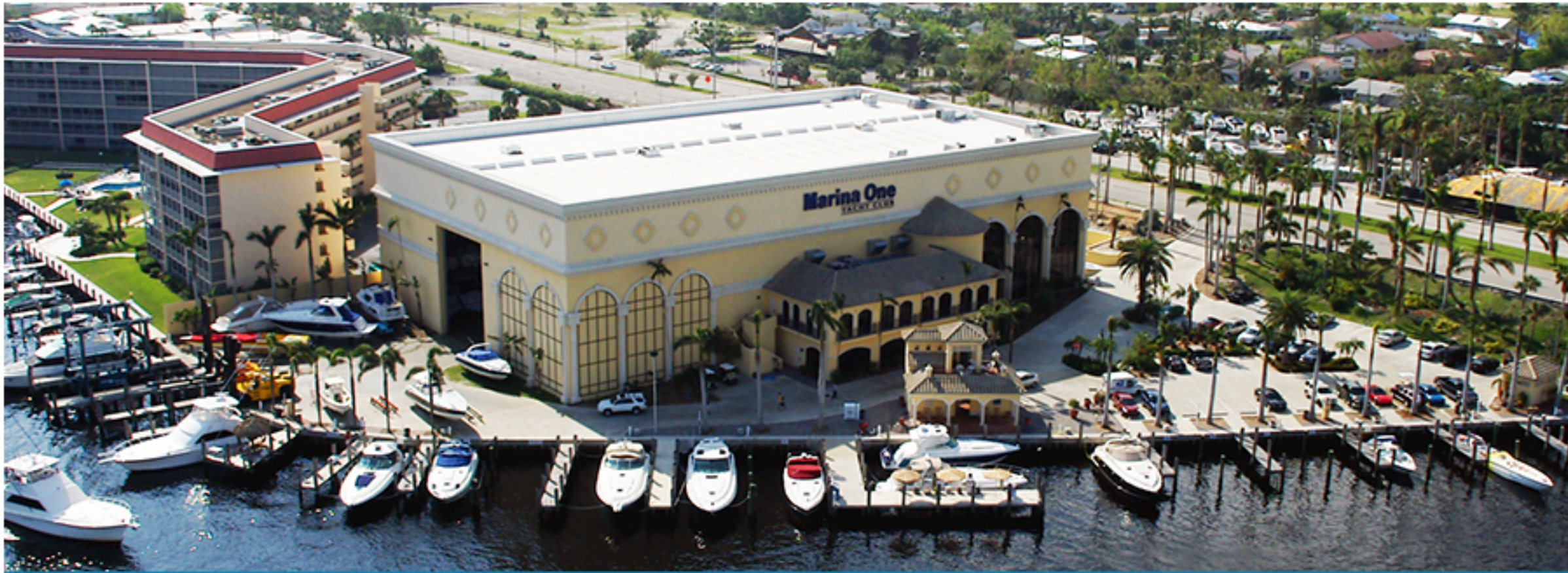
CONVENTIONAL STORAGE FACILITY MARINA ONE, DEERFIELD BEACH, FLORIDA