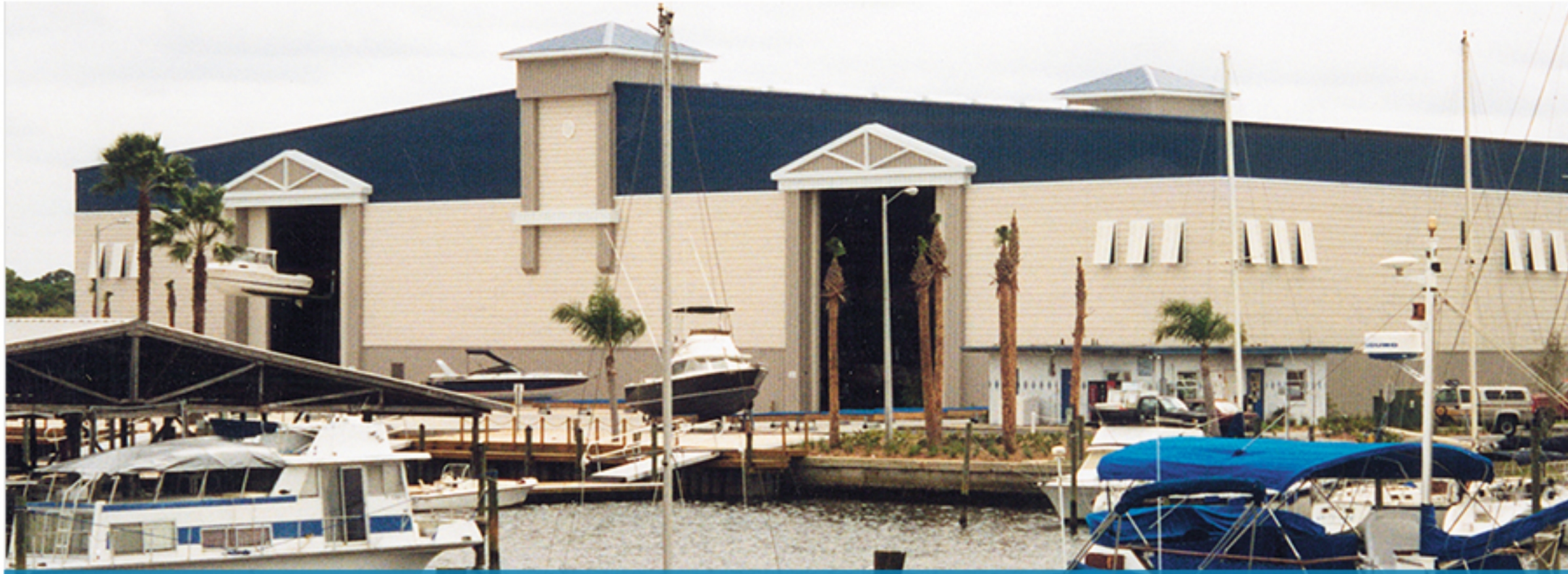
DOUBLEWIDE STORAGE FACILITY BAHIA BEACH MARINA, RUSKIN, FLORIDA