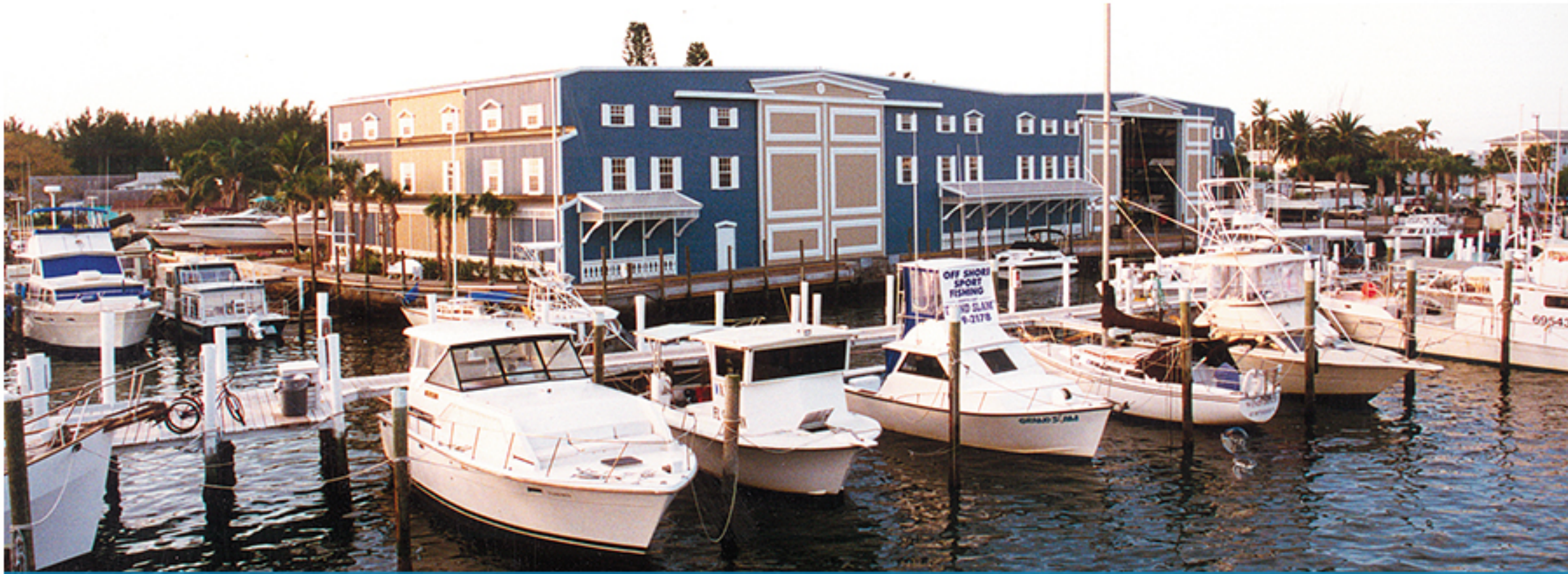
DOUBLEWIDE STORAGE FACILITY BAHIA BEACH MARINA, RUSKIN, FLORIDA