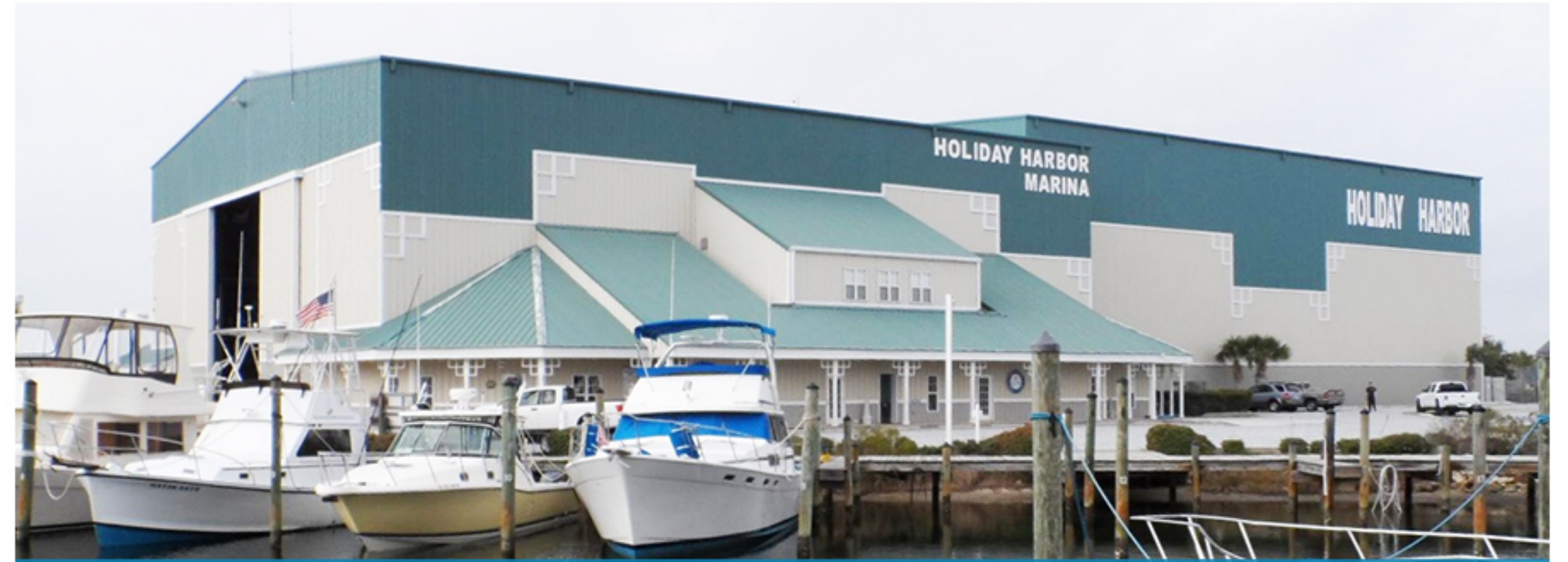
CONVENTIONAL STORAGE FACILITY HOLIDAY HARBOR, PENSACOLA, FLORIDA