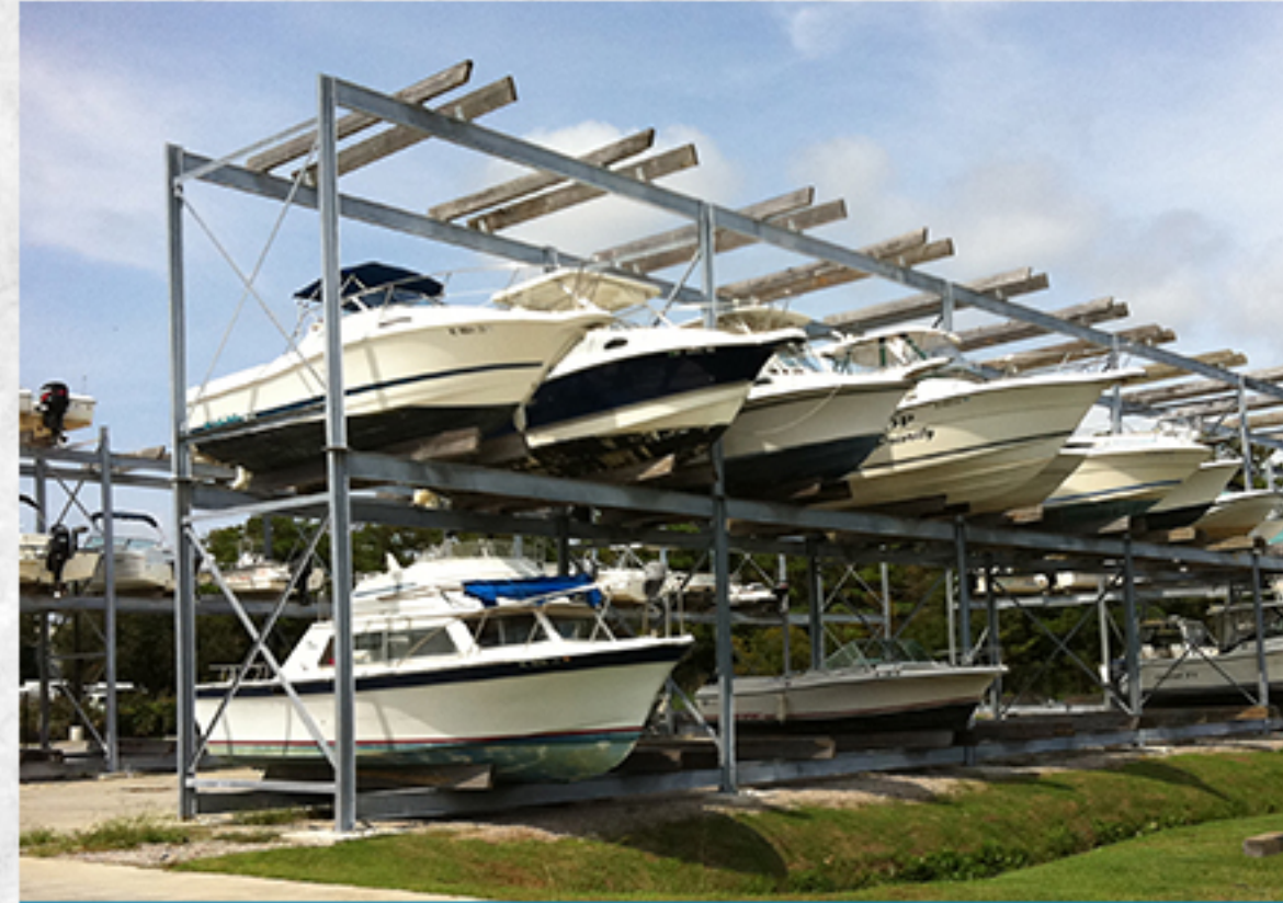
3 HIGH PORTABLE BOAT RACKS

ROOF & RACK's Portable Yard Stands and Portable Boat Rack Products provide our customers a SIMPLE and VERSATILE way to increase their CAPACITY, PRODUCTIVITY and REVENUE.