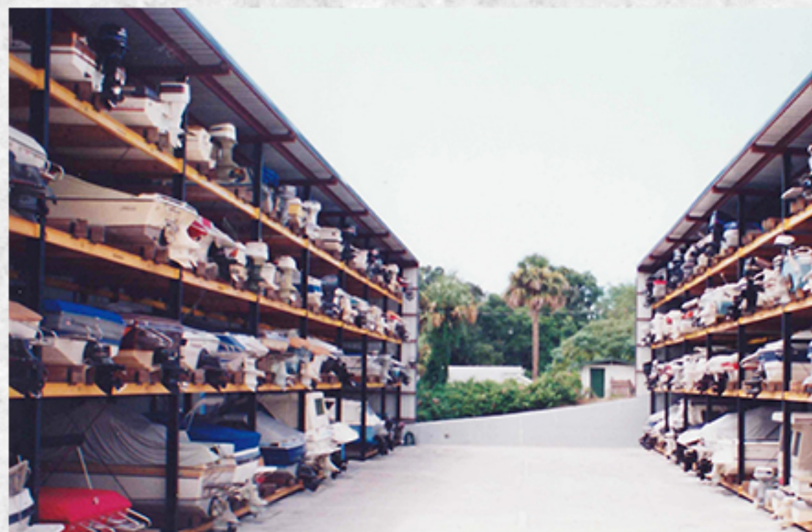
3 SIDED STORAGE FACILITY MT. DORA MARINA, MT. DORA, FL