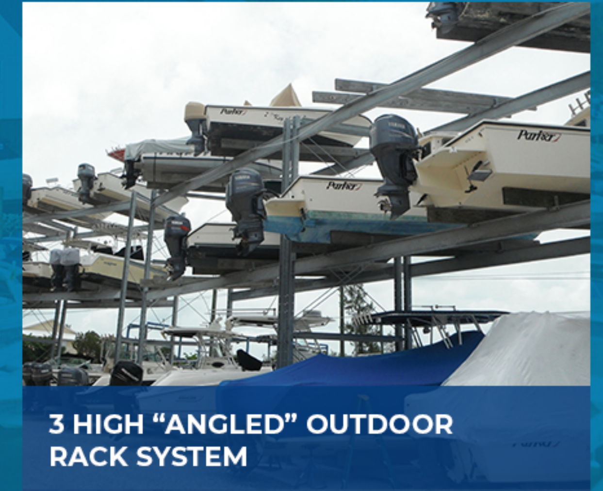
3 HIGH "ANGLED" OUTDOOR RACK SYSTEM

COST EFFICIENT AND HIGH RETURN VESSEL STORAGE SOLUTIONS