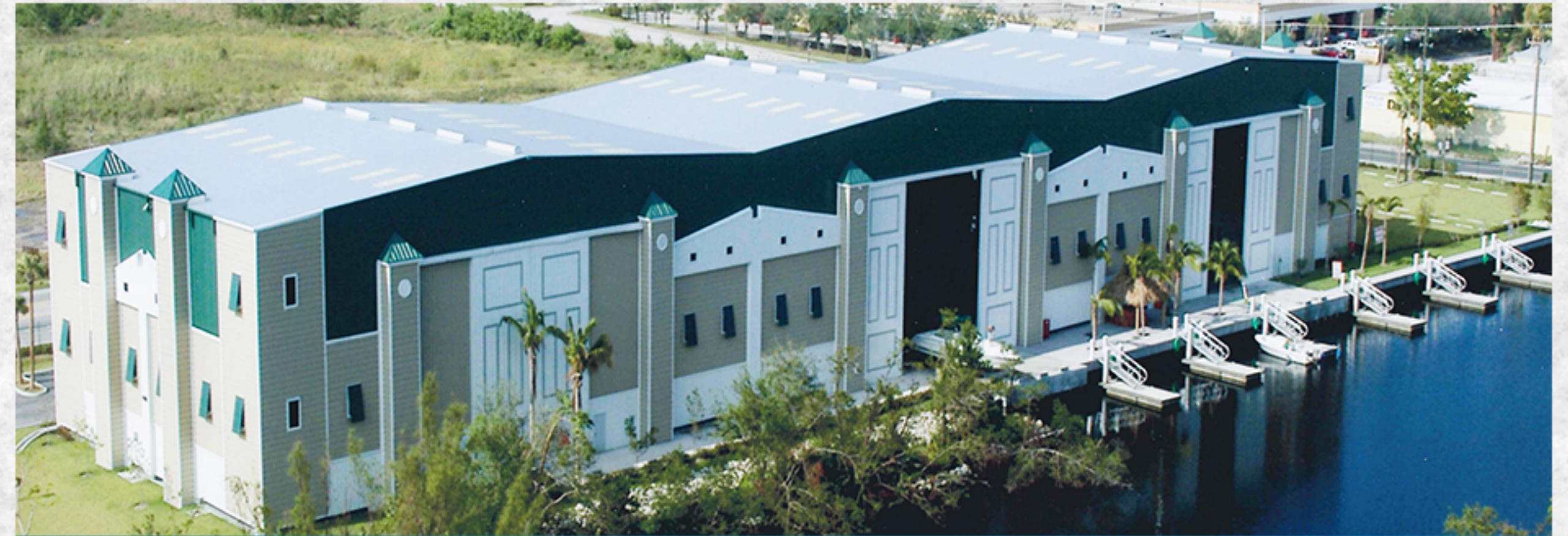
TRIPLEWIDE STORAGE FACILITY DANIA BEACH BOAT CLUB, DANIA, FLORIDA

ROOF & RACK can show you how to get more profit with our dry storage solutions.