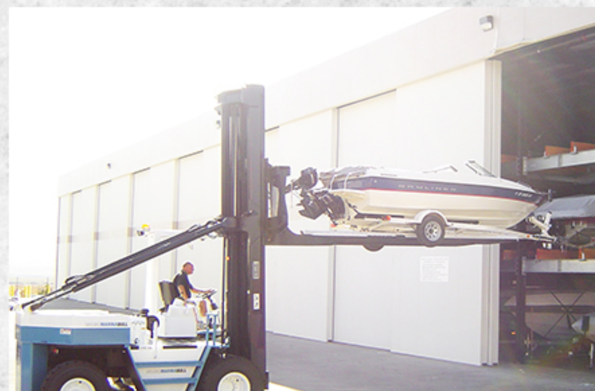
GABLED STORAGE FACILITY EL DORADO HILLS STORAGE, EL DORADO HILLS, CA

These styles of structures are an economic way to store vessels with added protection from the elements.