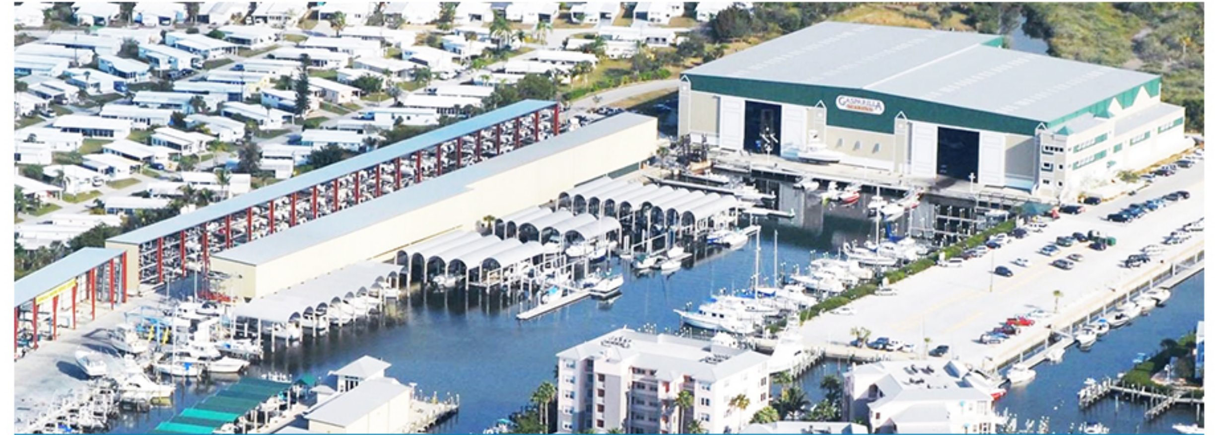
DOUBLEWIDE STORAGE FACILITY GASPARILLA MARINA, PLACIDA, FLORIDA

...YOUR DRY STORAGE FACILITY LOOK THIS GOOD!