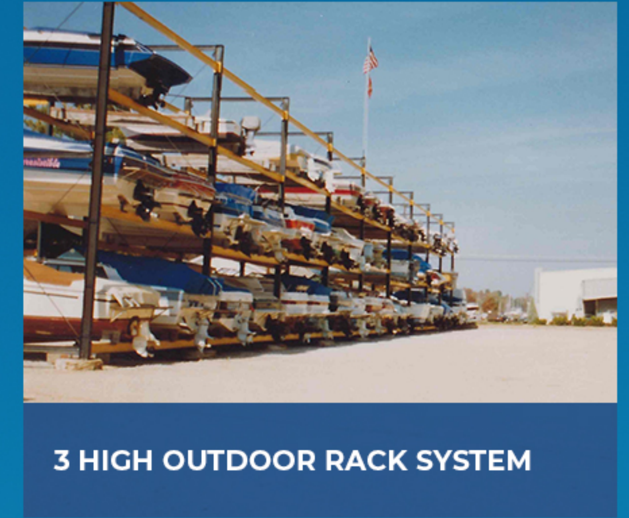
3 HIGH OUTDOOR RACK SYSTEM